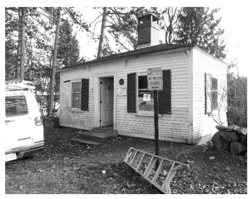
The thorough renovation of the Fiske Law Office will allow the building to be used, rather than standing empty as it has for more than two decades.