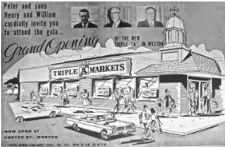
1967 Town Crier advertisement for the Grand Opening of the new Triple A Supermarket on Center Street. Comeau Construction took a long-term lease on the second floor. They finished the 2000-square-foot space, added dormers, and moved their offices from 395 Boston Post Road.

“I used all of the tricks I had learned in seminars to make this Perry Lane house SPECTACULAR. The house would end up having over two miles of electrical wiring, and each room had special lighting effects. The living room alone had three distinct lighting systems, with dozens of variations at the flick of a switch. The finished house had a lighting system that was so fantastic and so state-of-the-art that General Electric sent a team of photographers to the house to take pictures and notes. G.E. used those slides in their future seminars to show how lighting can affect the mood and appearance of a room. Our house was written up in two national magazines. From that time on, I designed all of the lighting for every home we built.