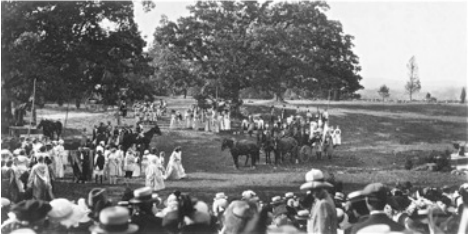
Arrival of George Washington to Weston. The official program lists 173 participants in this grand finale.