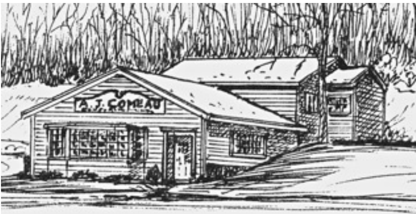
The company office moved to 395 Boston Post Road in 1958. Artist unknown.

Footnotes and bibliography on page 23, at the end of the next article.