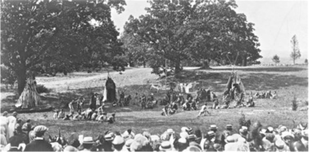
Photograph of the Indian campground scene at Weston's 200th anniversary pageant. The official program lists the names of 100 adults and children who participated in the Indian scenes.