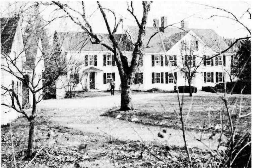
Looking west and slightly north showing west (front) of house and south (front) of outbuilding.