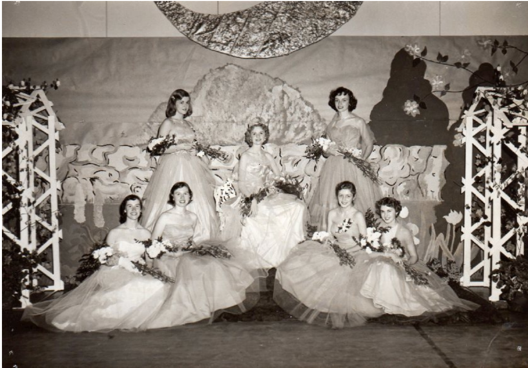
Weston High School prom, 1953-54 school year.

high school became a junior high. In September, 1970, after completion of the present junior high school in 1969, the former junior high was remodeled and made ready for occupancy as an elementary school christened “Field School” following the rural naming theme already established with Country, Woodland, and Brook. At that time Field was used as an “intermediate” school for grades 4, 5 and 6.