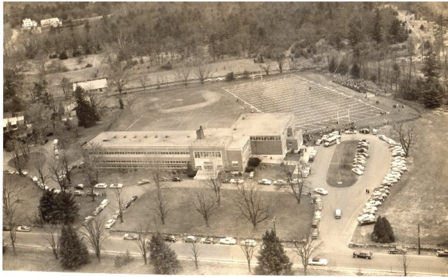
The football field behind Weston High School (now Field School) can be seen in this aerial view probably dating to the 1950s.

Plans changed dramatically after a disastrous April 7, 1948, fire that gutted the Weston High School (now Brook School Apartments C). At a Special Town meeting a few weeks later in May, Town Meeting took quick action, voting to abandon the idea of a new