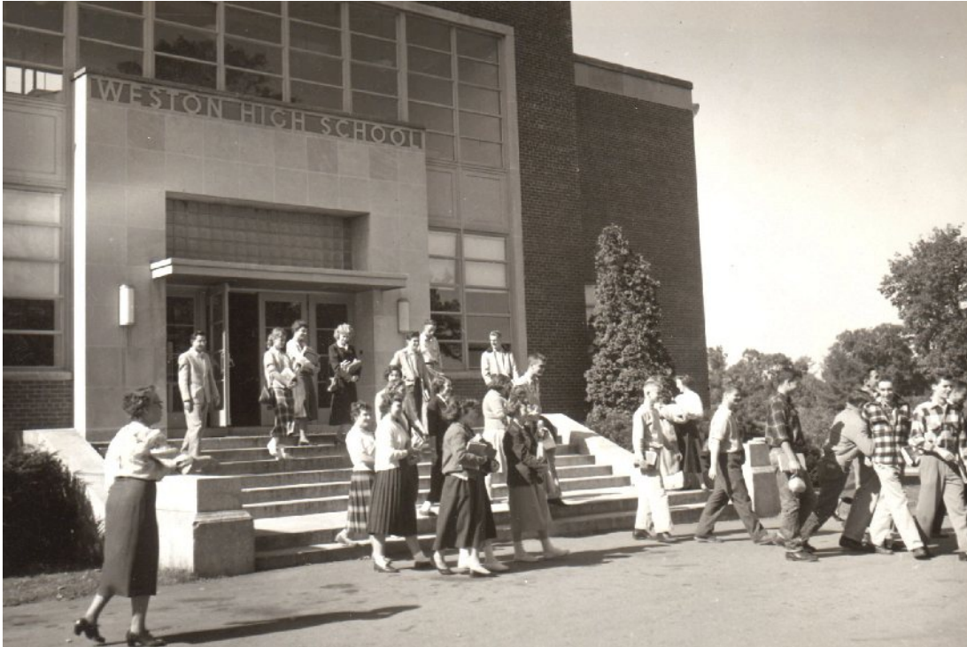
The Field School opened in 1950 as Weston High School and has served the community as a high school, junior high, and upper elementary school. Its future is now under study.